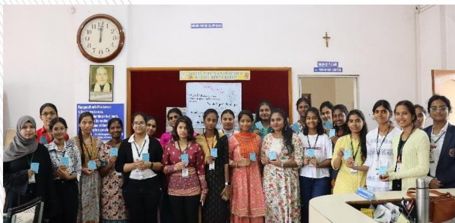
STAR USER MEET